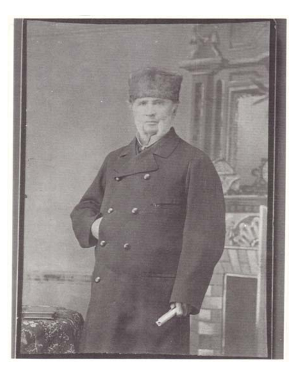
St. James Anglican Cemetery